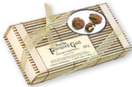
06.90 Store Box 250g