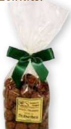
06.840 Bag 150g