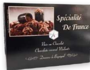
06.97 Spécialité de France 80g