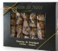
16.52 Black box 125g