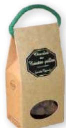
08.40 Kraft box 100g