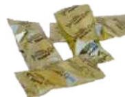
06.99 Individual minipacks