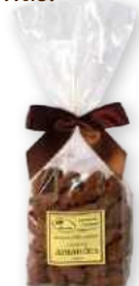
06.843 Bag 150g