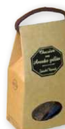
08.39 Kraft box 100g