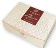
16.06 Ivory Ballotin Arlequines 100g