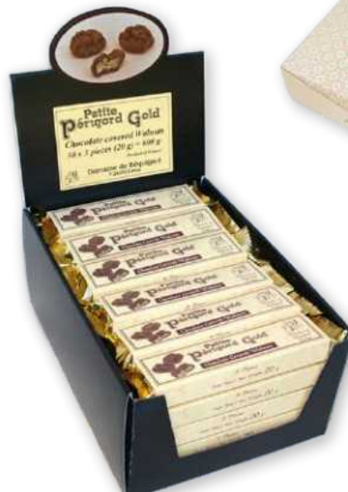
06.940 3 pieces pack 20g Display 25 packs