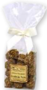
16.51 Bag 120g