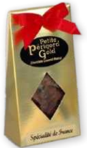
06.900 Standing gold Triangle 100g