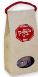
08.41 Kraft box 100g