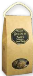
08.38 Kraft box 100g