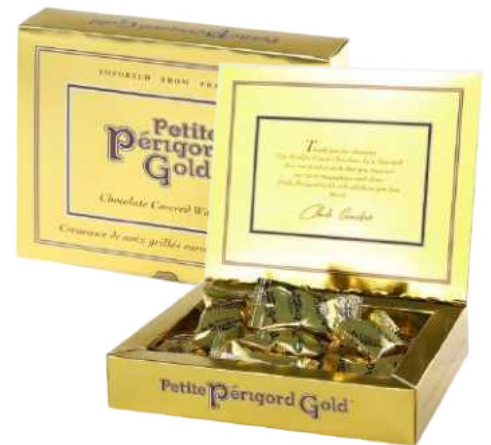
06.95 Gold box 150g