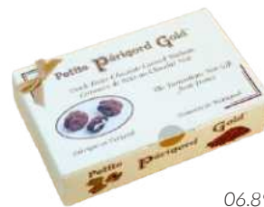
06.89 Petite Perigord Gold box 100g