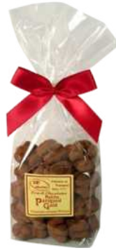
06.91 Bag 150g