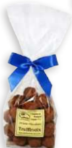
16.38 Bag 150g